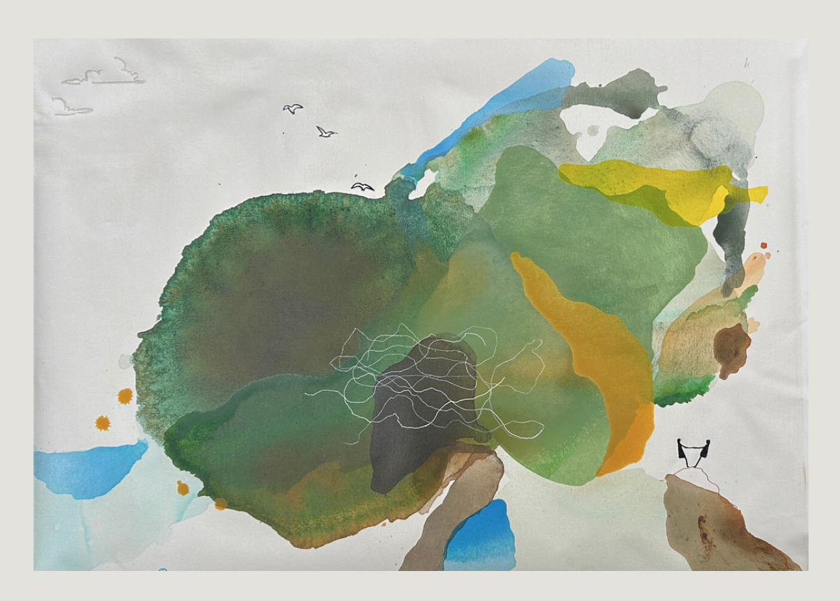
Trail of Seagulls - 2024