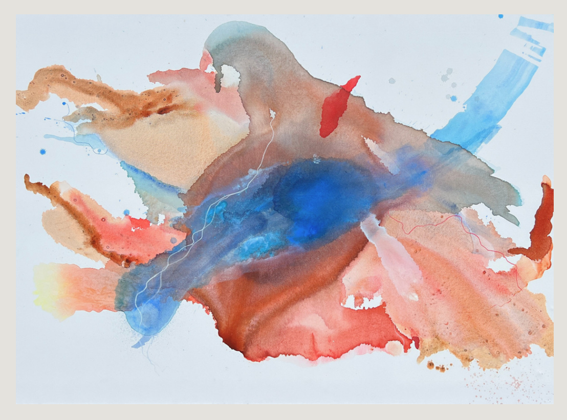
Kerid - 2023