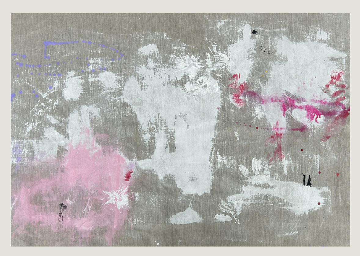
Clouds - 2024 100x150 cm, Mixed medium, on linnen

"Clouds," is about the soft, fleeting nature of memories and emotions. The light colors and abstract shapes feel like a sky full of shifting clouds. Little details, like a flower vase and tiny figures, add a sense of connection and story. It's a calm, dreamy piece that reminds us of life's delicate beauty.