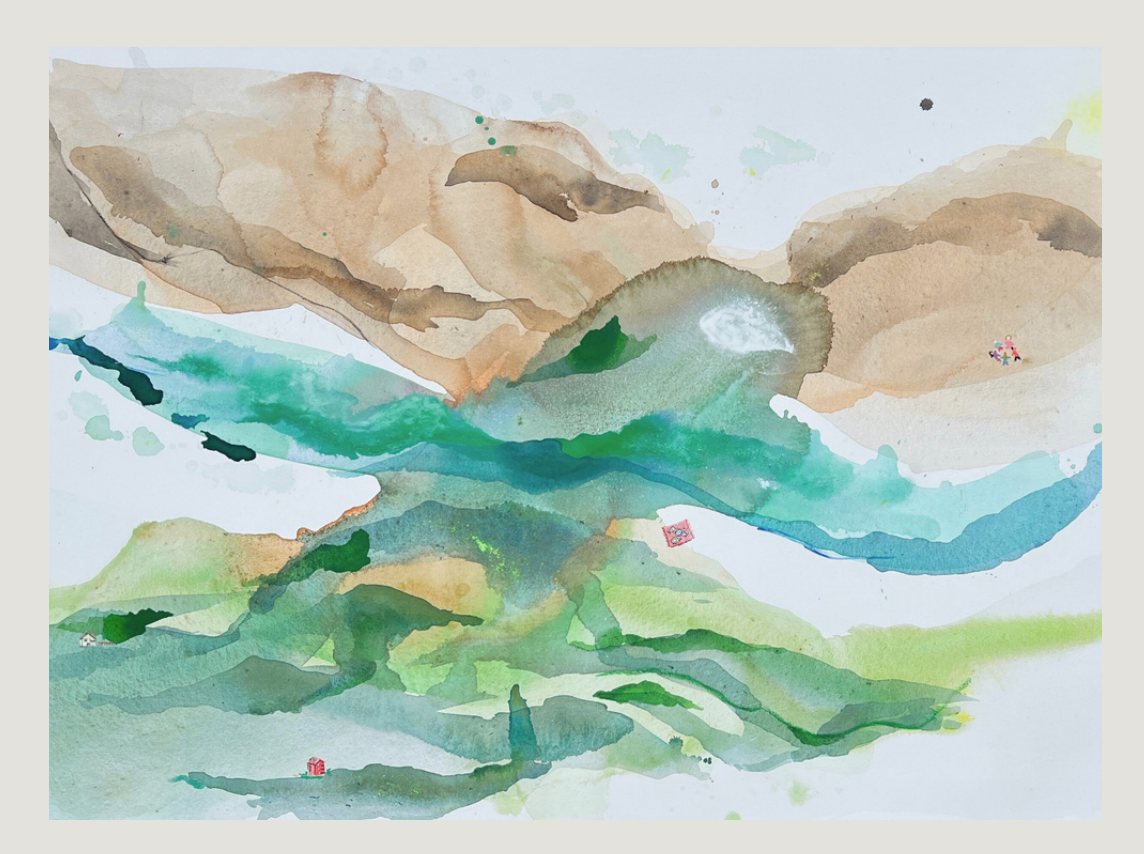
Yusufeli - 2024