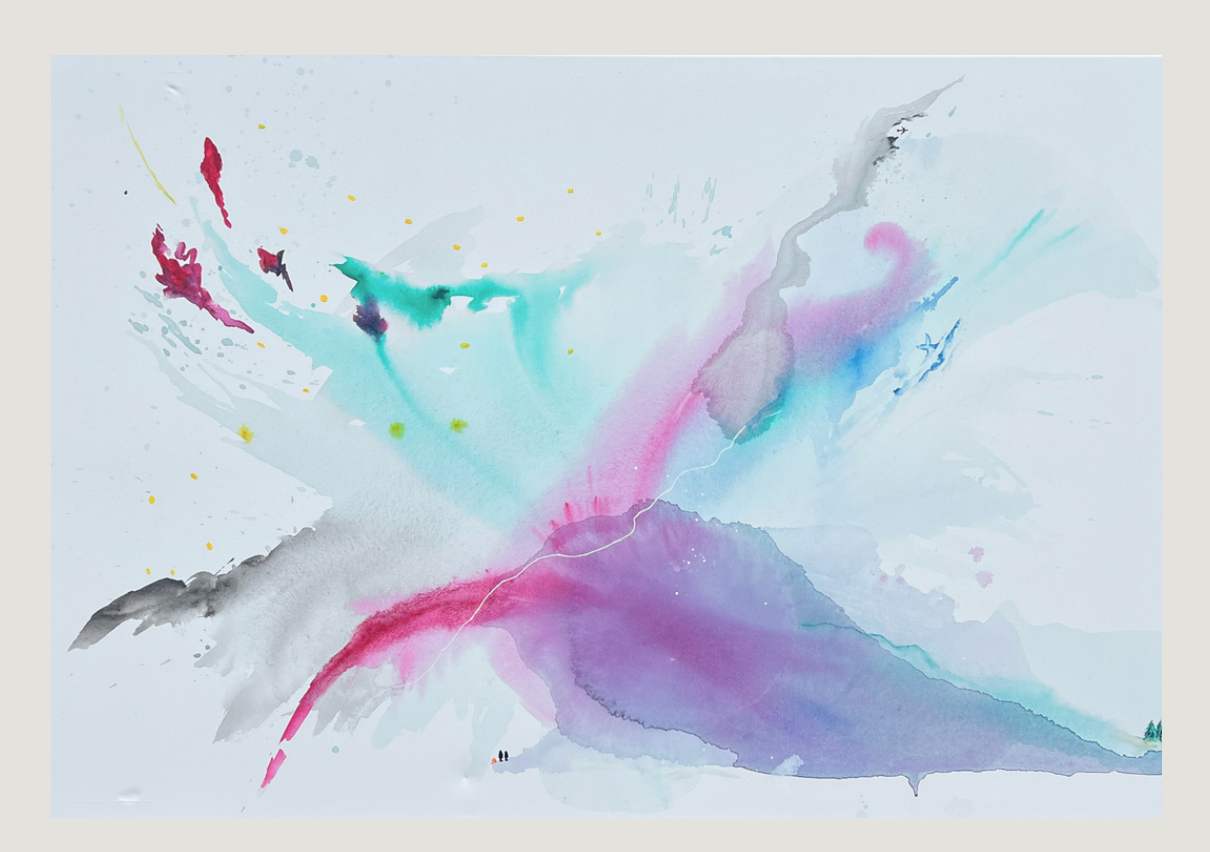
The Lights - 2023 100x150 cm, Mixed medium, on canvas

Tromso, I witnessed the inspiring, unbelievably beautiful Northern Lights, a spectacle that completely captivated me. This piece is born from that unforgettable experience, drawing inspiration from Norway's stunning natural beauty and the ethereal dance of the lights. It's my attempt to capture and share the magic and wonder of those moments under the Arctic sky.