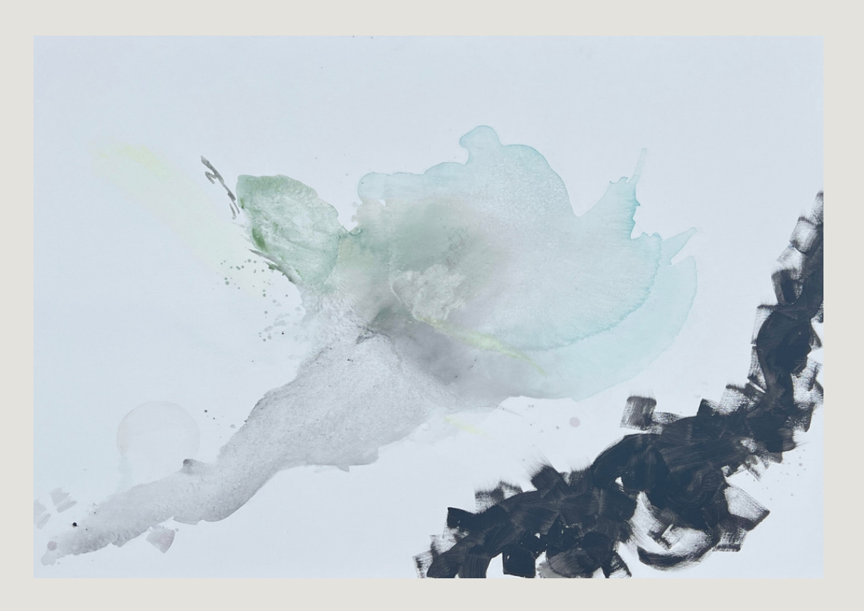
<u>Fly - 2022</u>